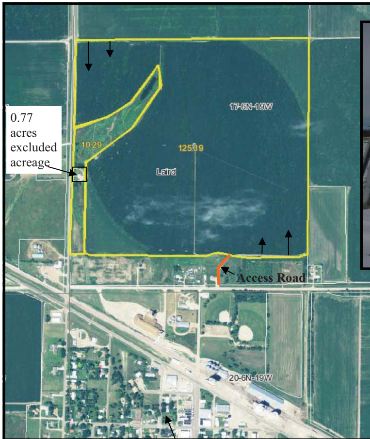
City of Loomis