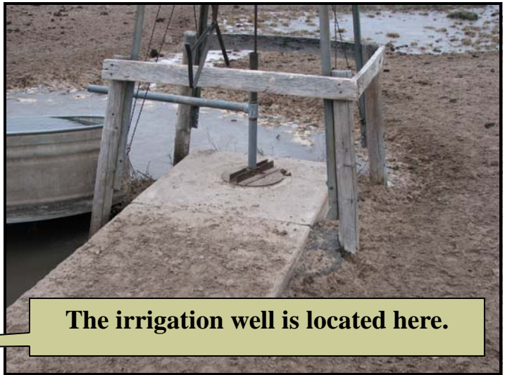
The irrigation well is located here.

The yellow line represents the offered property. The Seller is willing to work with a Buyer's offer on the proposed boundary. A survey will be required for the property boundary.