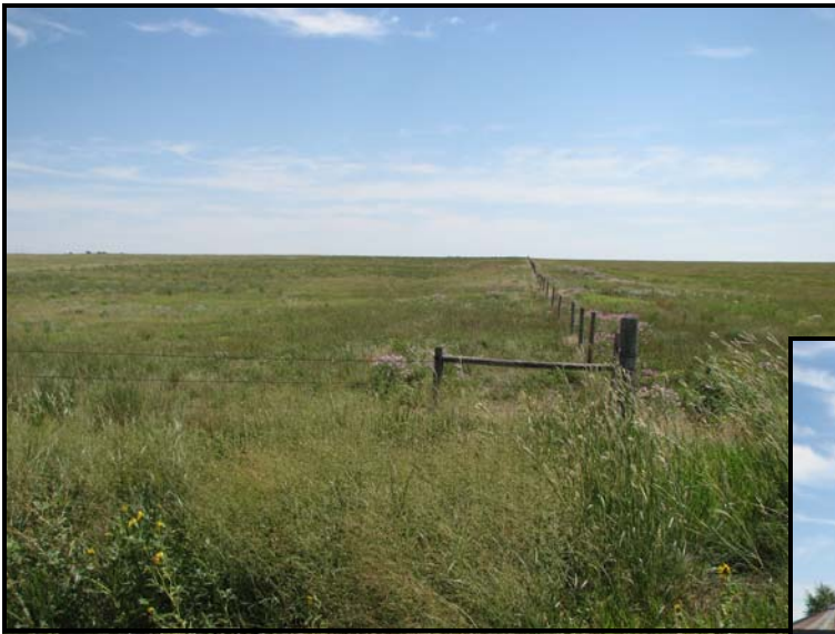
Northwest Corner of Pasture