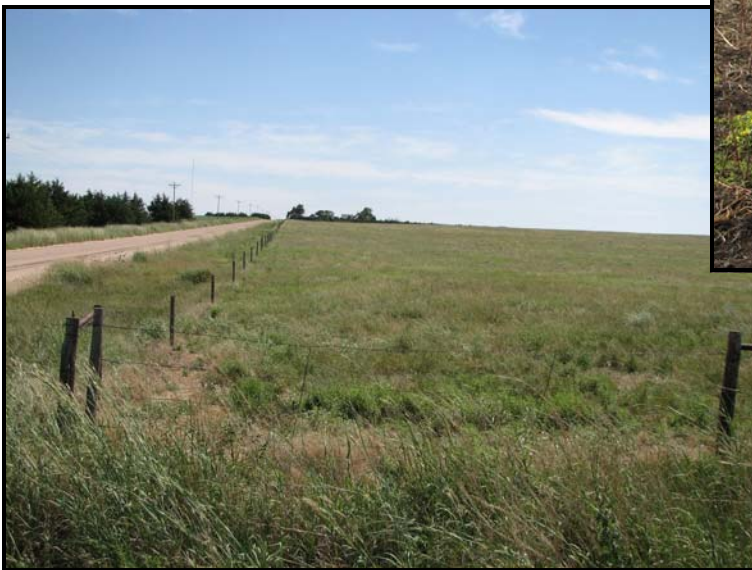
Northeast Corner of pasture