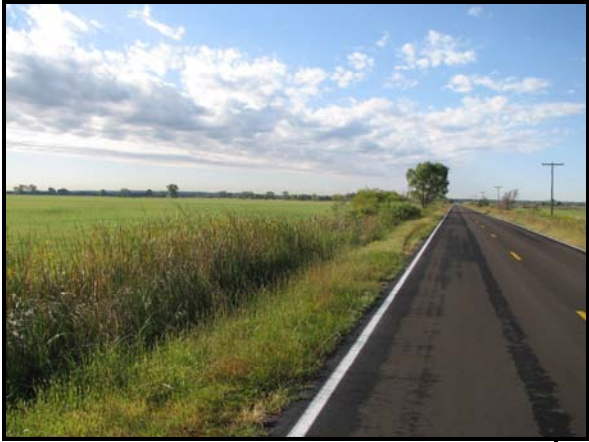
Great access off of North Airport Road