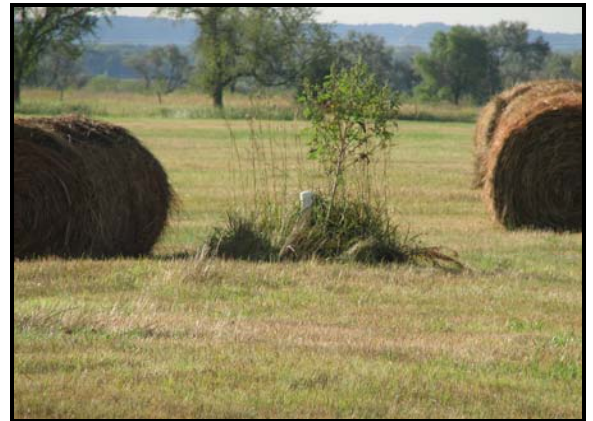
Cased well for submersible or solar pump