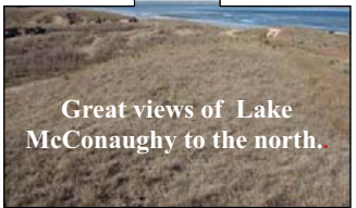
Great views of Lake McConaughy to the north.